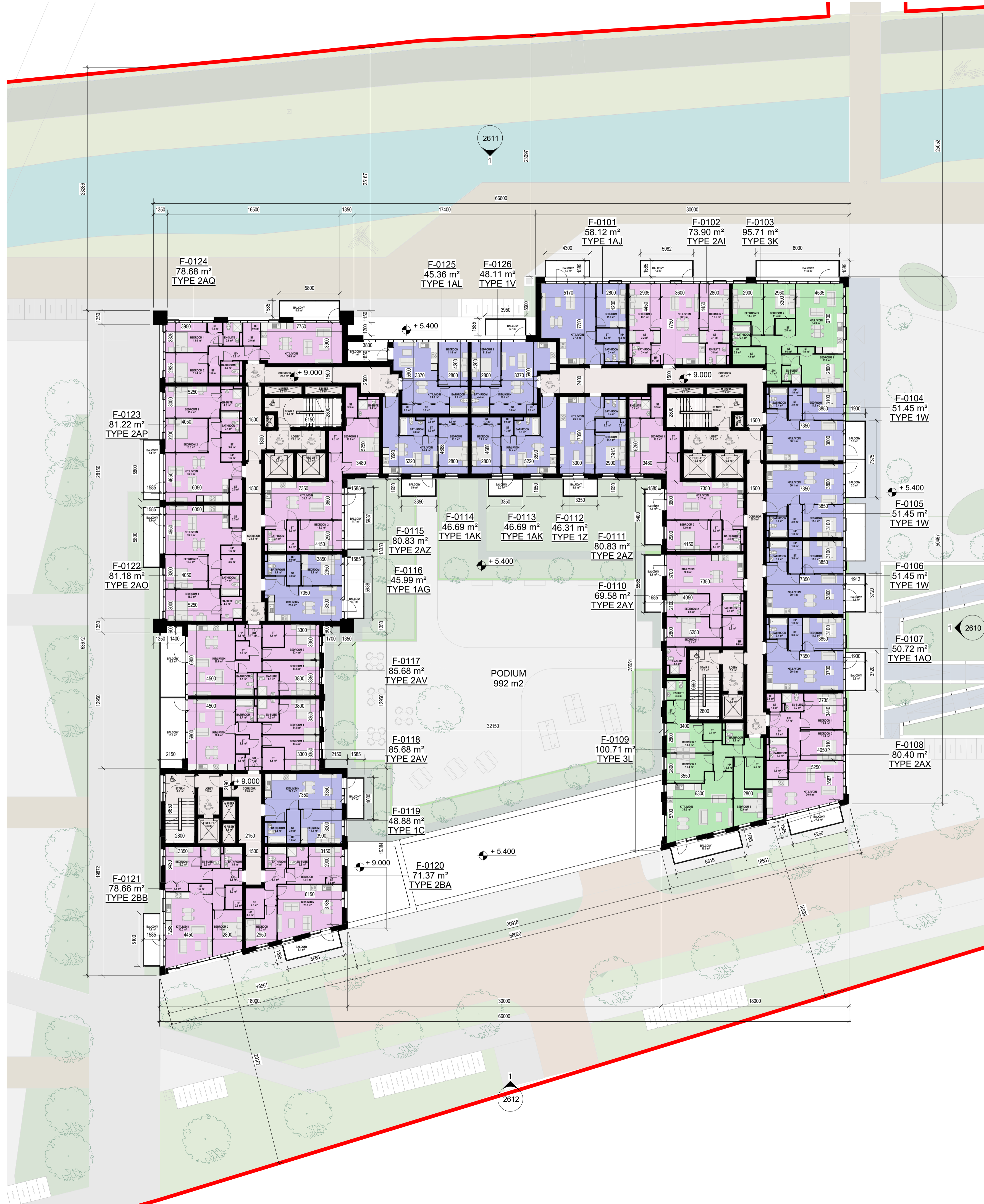
Accommodation Schedule-BLOCK F_L01

Please consider the environment before printing this sheet